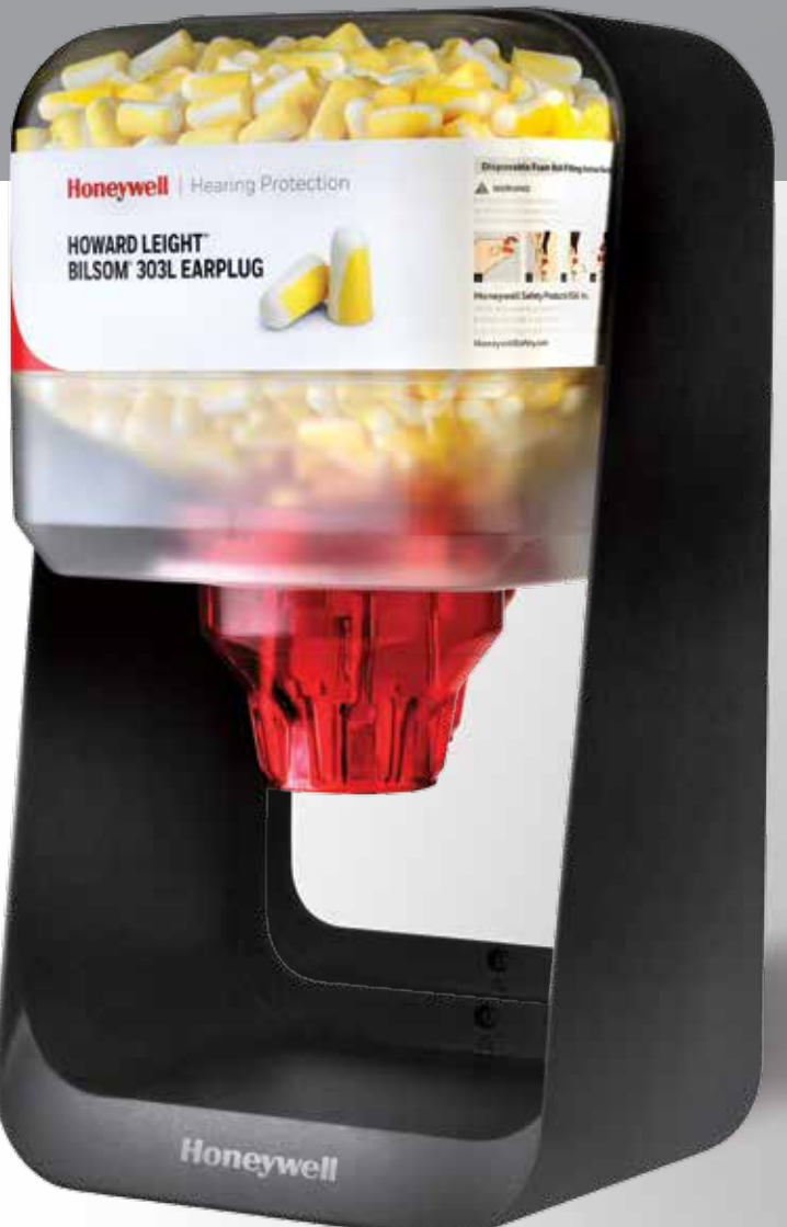
HL400-F Full Frame