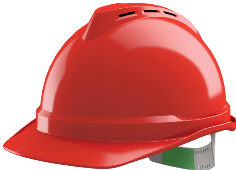
V-Gard 500 vented Push-Key