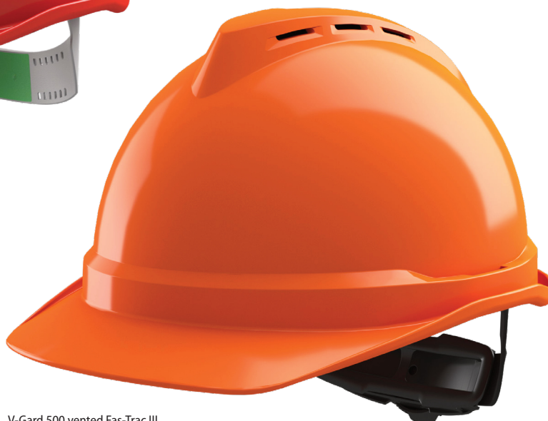
V-Gard 500 vented Fas-Trac III