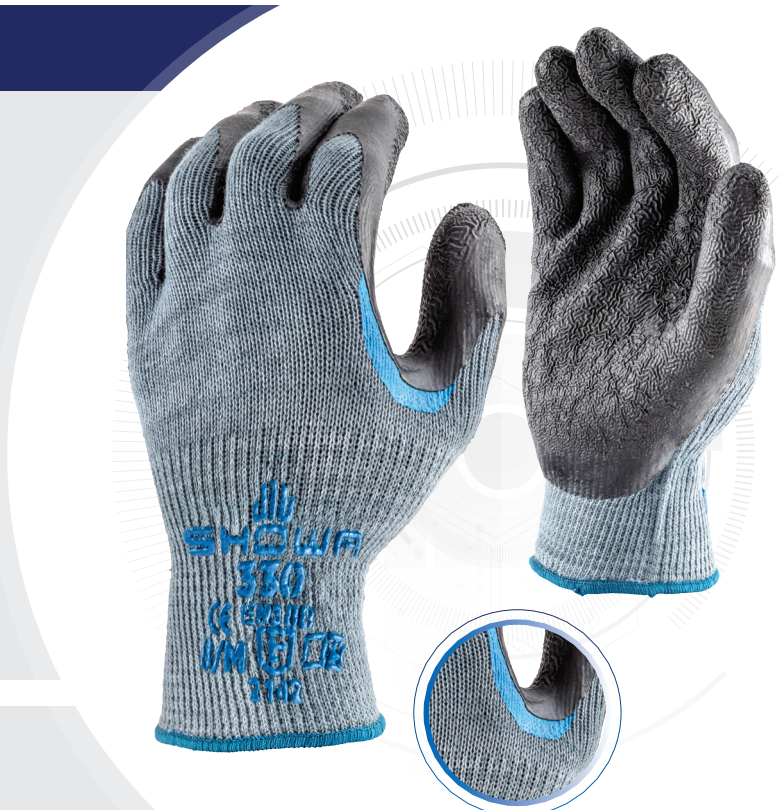
Reinforced thumb crotch